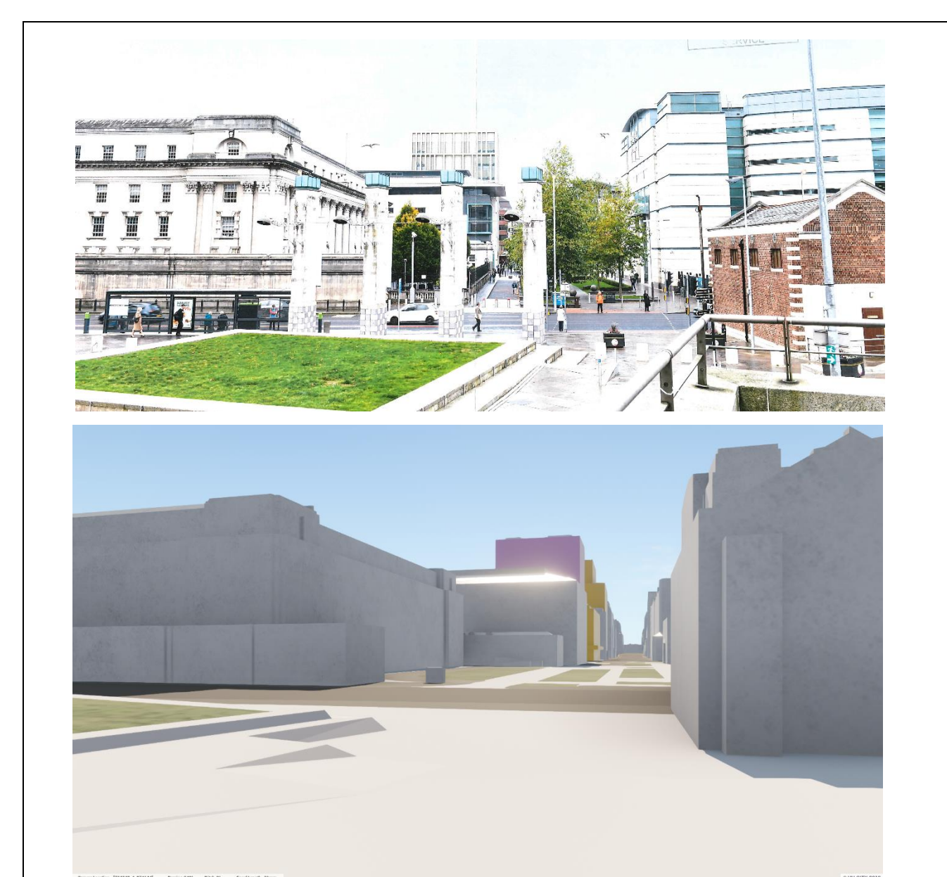
Above: View from Oxford Street Below: View from Victoria Street